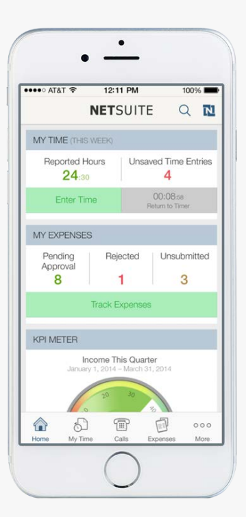
Run your services business on the go!